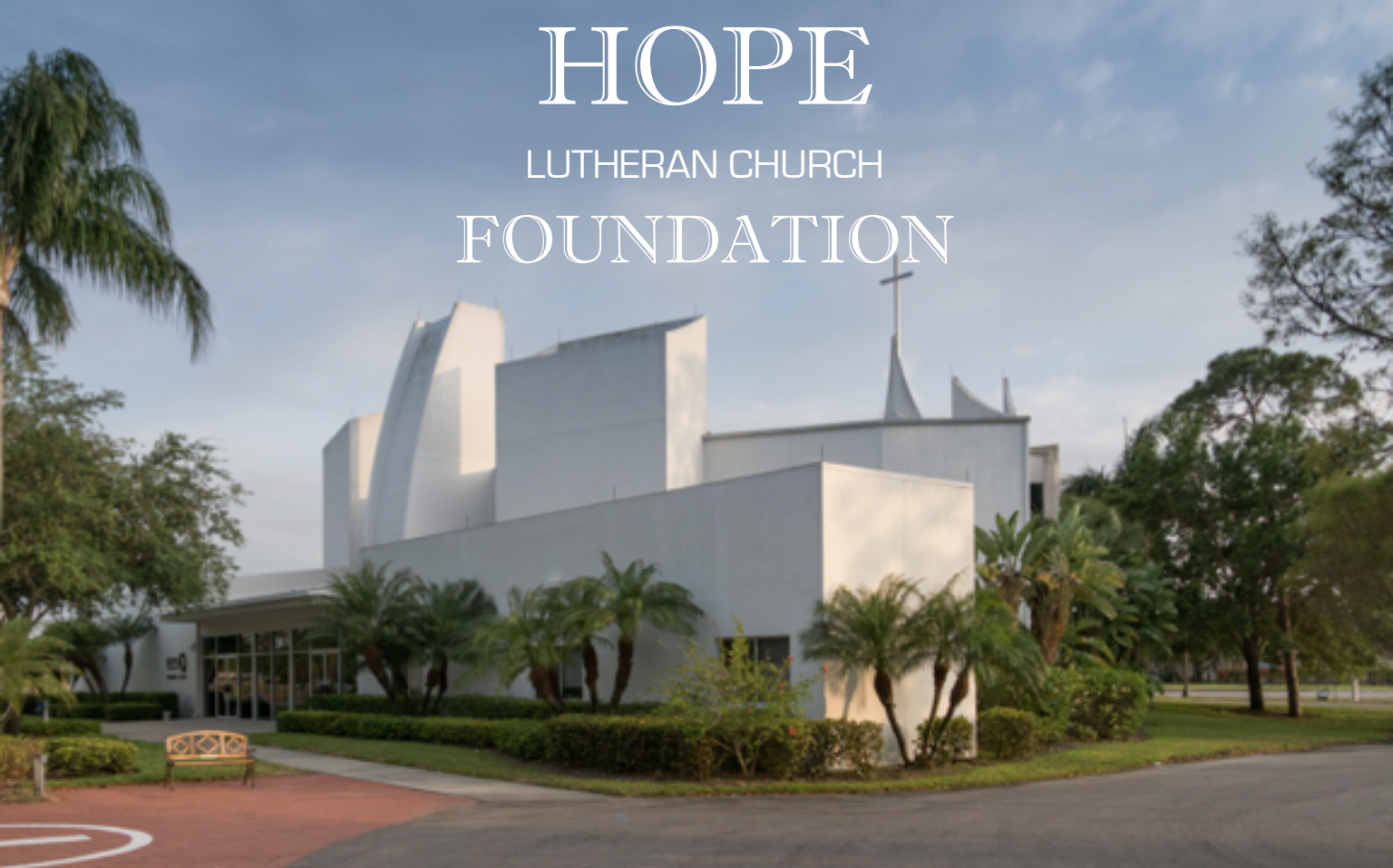
Hope Lutheran Foundation Grant History